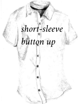
short-sleeve button up