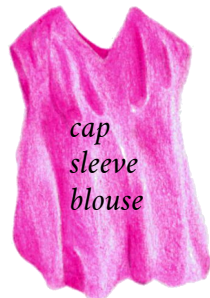
cap sleeve blouse